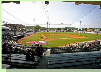
Fraser Field, Lynn MA circa 2005